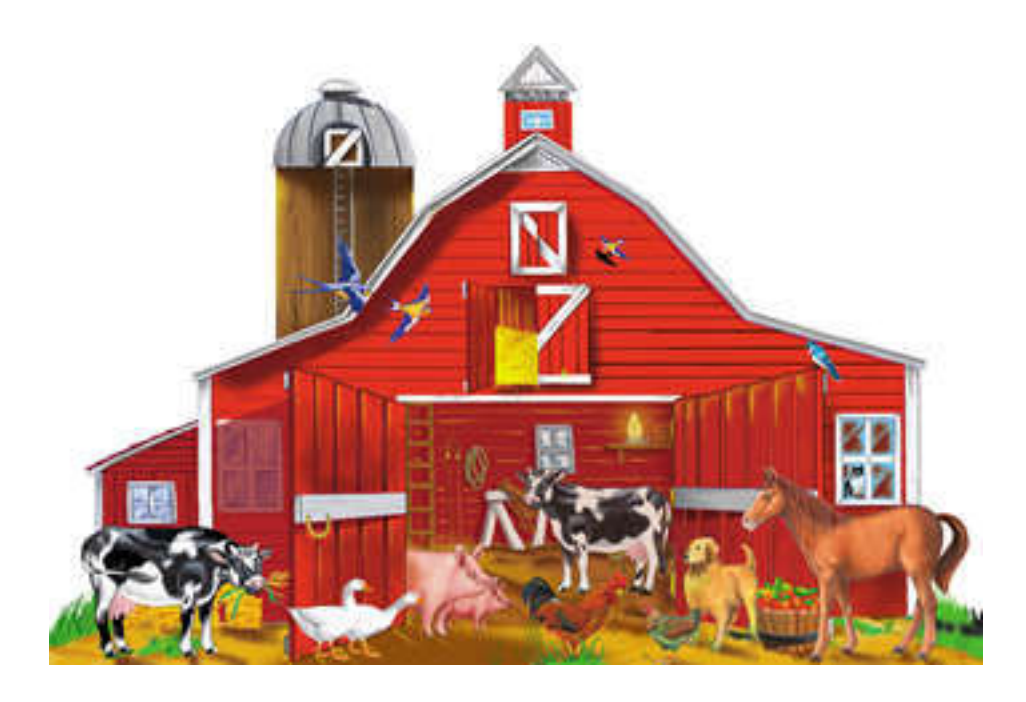
I'm Just a Farmer, Plain and Simple