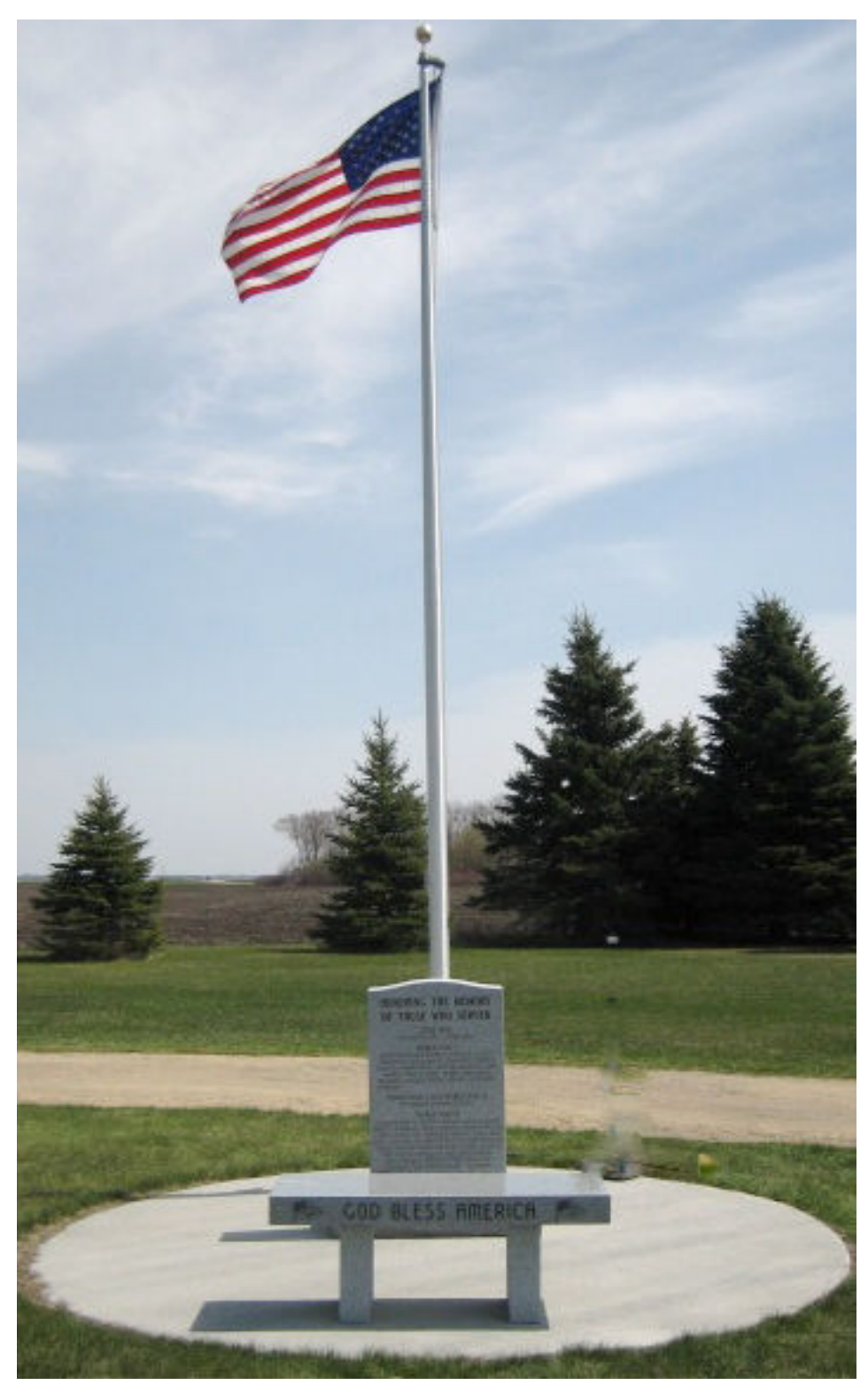
Concordia Cemetery Association Memorial Day '08