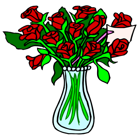
A potluck lunch will be served following the service.