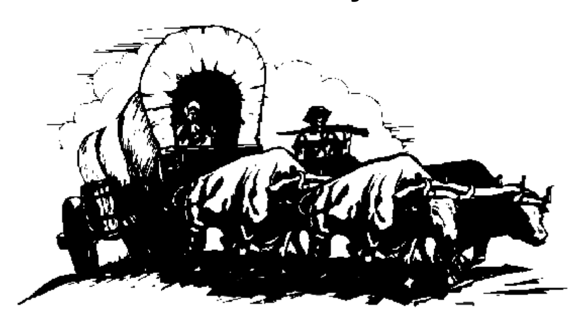
By Levi Thortvedt

Excerpts from the serial published in the Moorhead Daily News in 1938