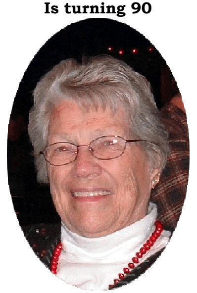
Sunday, May 16

We'll begin the celebration during the morning church service