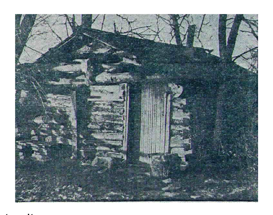
By Levi Thortvedt Excerpts from a serial published in the Moorhead Daily News in 1938

Sketch of the Thortvedt cabin by Orabel Thortvedt