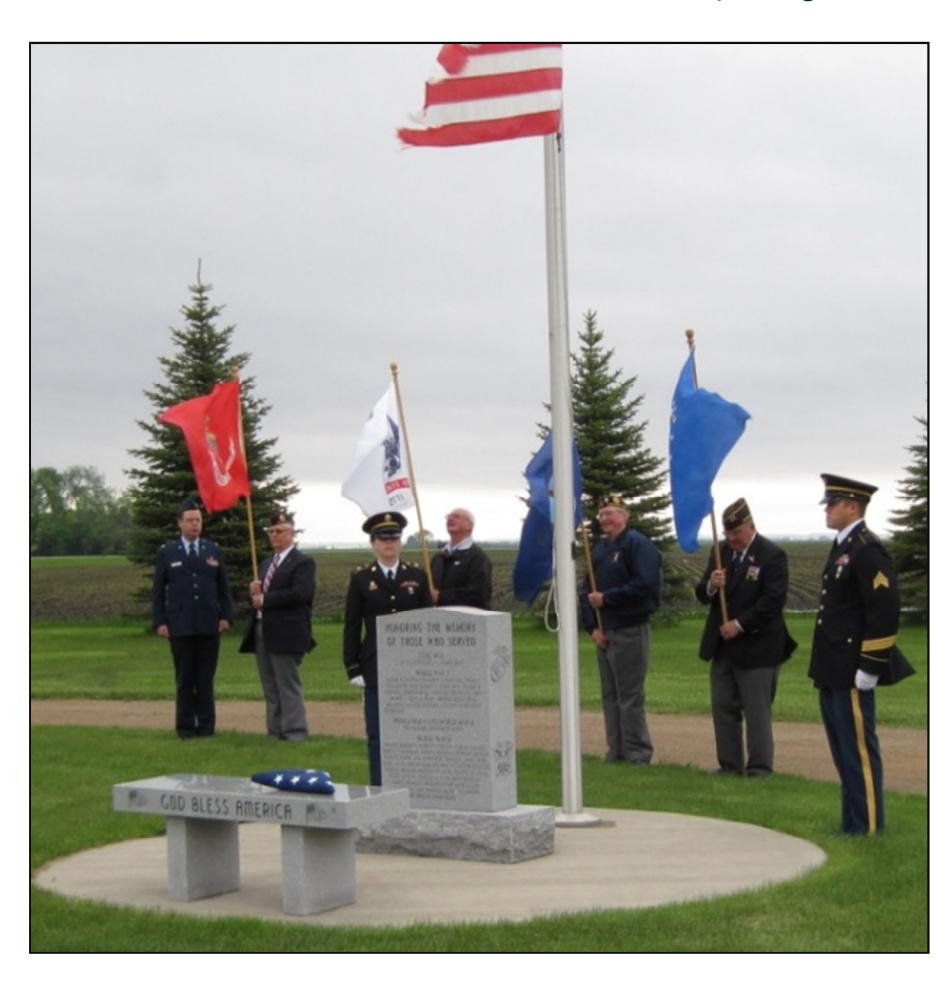
Memorial Day at Concordia - 2011