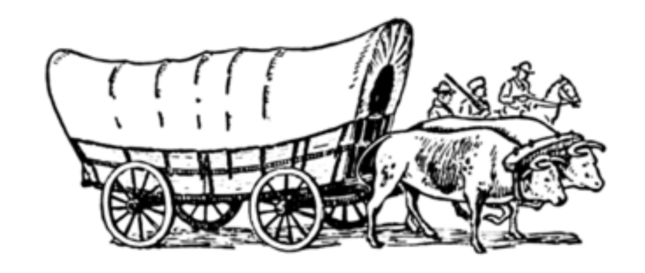
Saturday, Sept. 22, 2012 – 10 a.m.