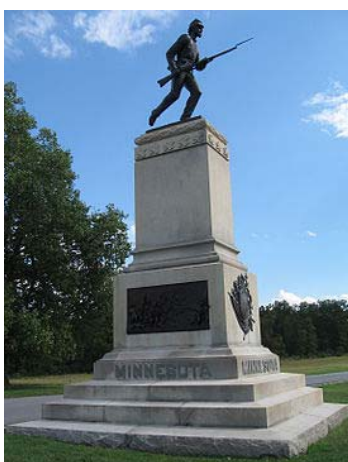
Monument to the 1st Minnesota Infantry Regiment at Gettysburg Battlefield, Gettysburg, Pennsylvania, located on Cemetery Ridge, off South Hancock Avenue.

Montgomery I had an opportunity to tour many of the historic sites of the civil rights era. Another MN Lutheran and I drove to Selma Alabama which was the start of the most famous march of the civil rights movement as thousands of people of all backgrounds marched peacefully from Selma to Montgomery only to be attacked by uniformed personnel without provocation. We toured a museum in Selma that made no mention of that infamous day and the propiator seemed displeased when we asked if there was any information about that era available to review. Perhaps there is no connection between the members of Concordia Lutheran and that particular march 50 years ago. However, it is possible there is a connection between Concordia and another march that occurred 100 years prior not during the Civil Rights Movement but the Civil War. As most of you know 2 of our members were Civil War vets. I do not know the campaigns they were in but they supported a war that brought even more basic human rights to black people than even the march