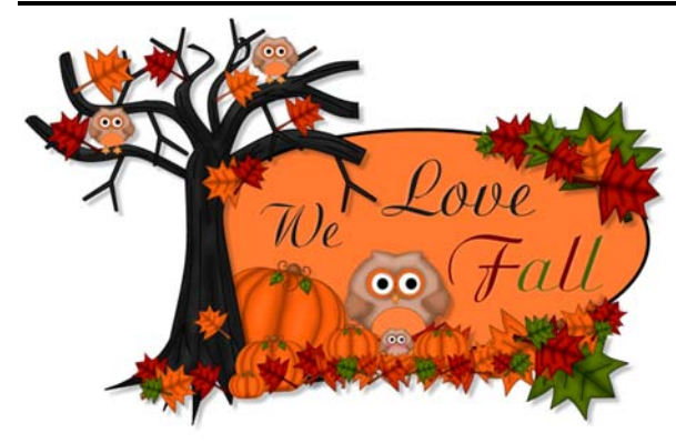
Fall Begins on Sunday, September 22.