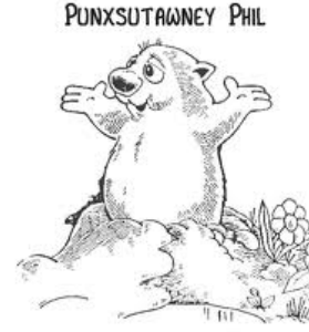
HAPPY GROUNDHOG DAY!