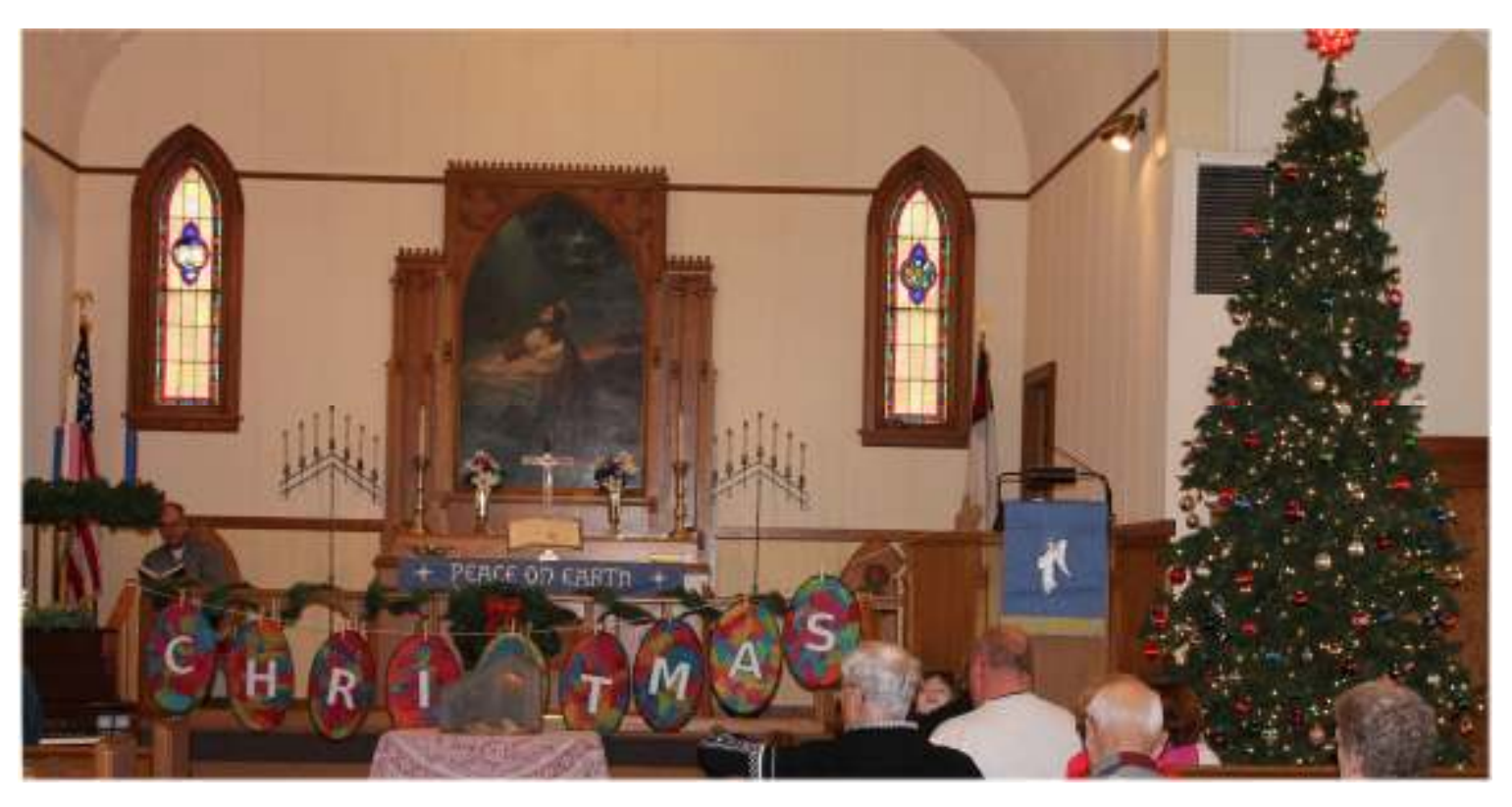
Concordia decorated for Christmas