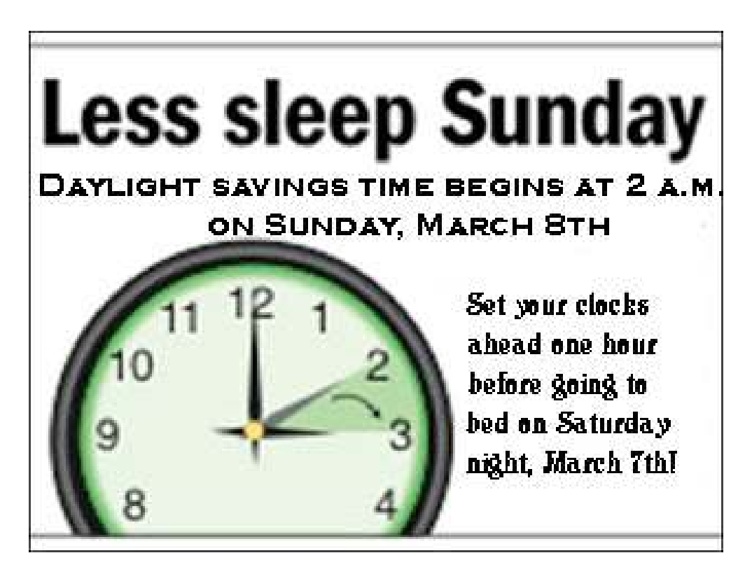
Daylight Savings Time Begins March 8th

It is not repentance that saves me; repentance is the sign that I realize what God has done for me through his Son, Jesus Christ.