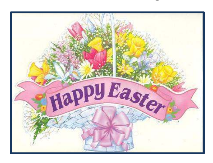
Services at 10 a.m. Easter Morning Sunday, April 5