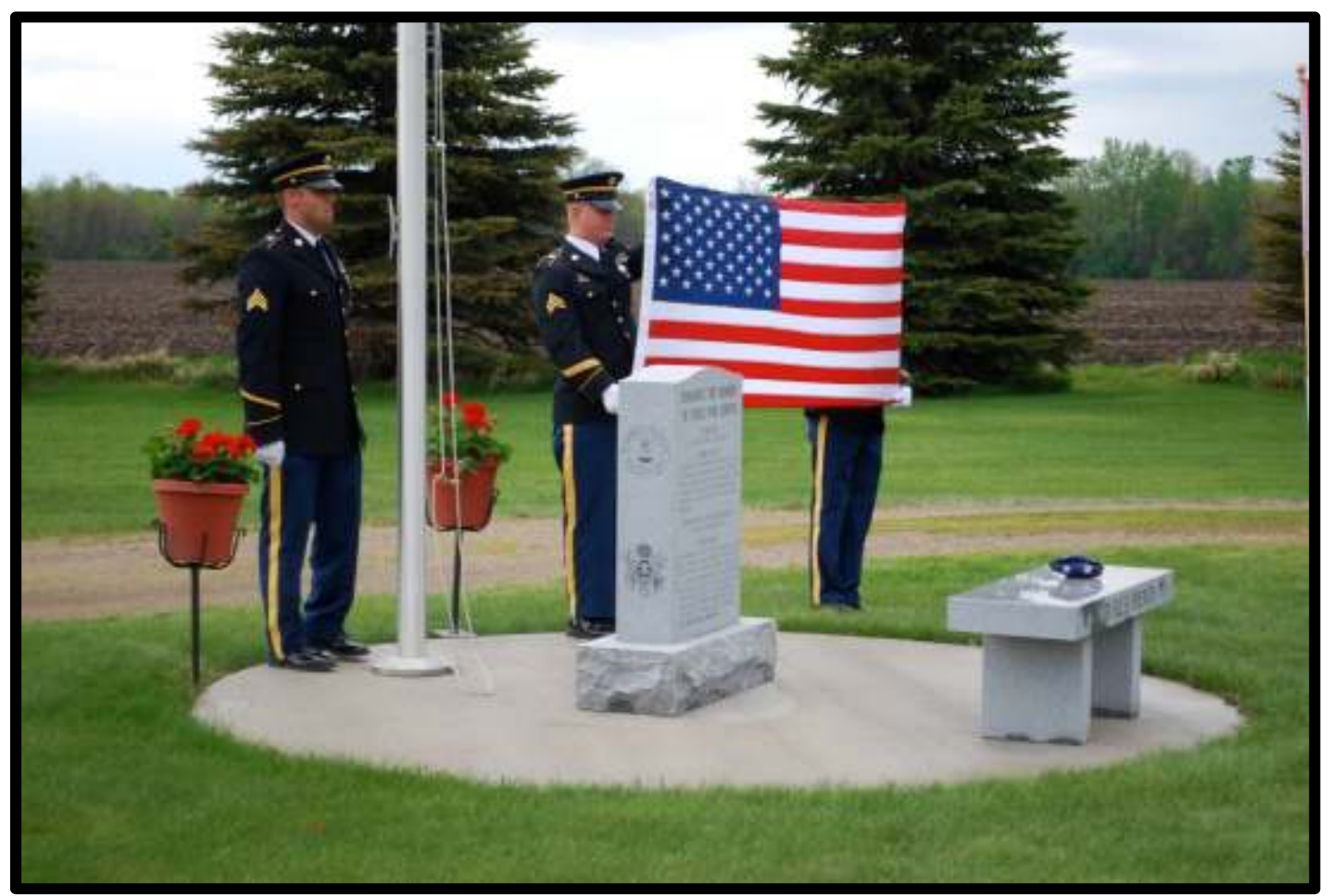
Graveyard Service, Memorial Day 2015