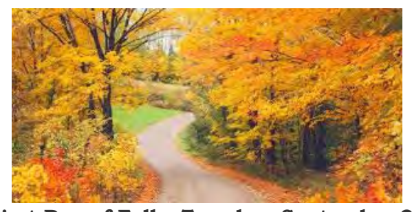
First Day of Fall - Tuesday, September 22